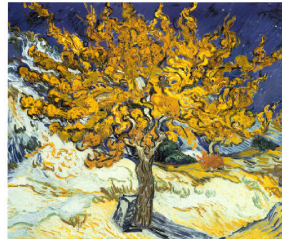
Vincent van Gogh 1889