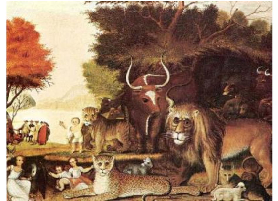
Edward Hicks c.1845